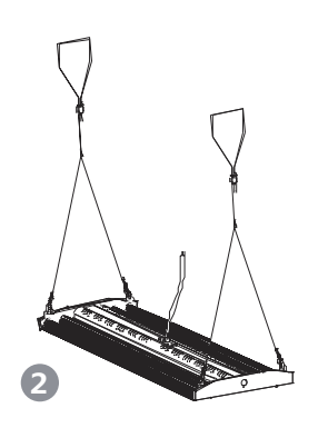
STEP TWO Connect ropes with high bay properly and make sure the high bay is hanging straightly