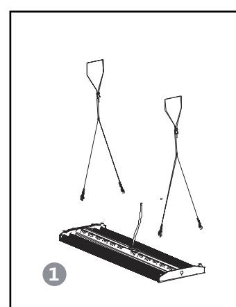
STEP ONE Take out the hanging ropes and adjust them to right and equal length